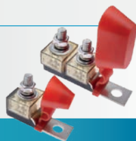
Fuses + holders*