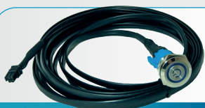
Remote ON/OFF Switch 1m, 2m or 5m*