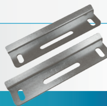
Battery Mounting Brackets*